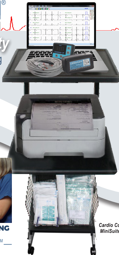
Cardio Complete MiniSuite™

(laptop, cart and printer sold separately)